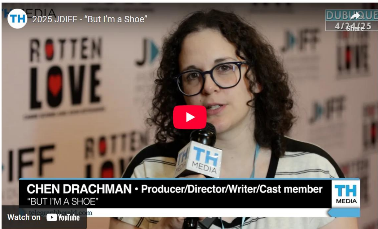
2025 JDIFF - "But I'm a Shoe"